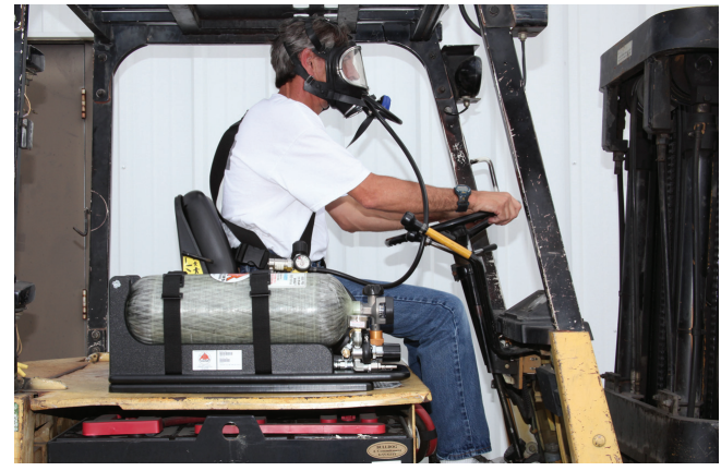
PAK-SFL™ & bracket mounted on forklift